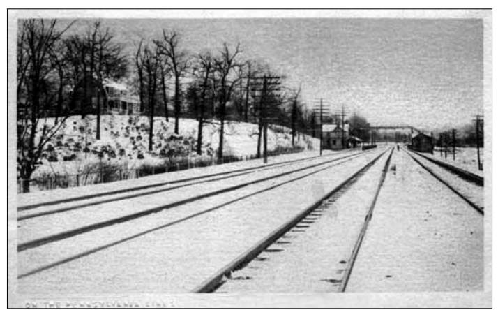
A 1920 postcard showing, at right, Quaker Valley station, looking east, before Ohio River Boulevard was opened in Edgeworth and the tracks were moved closer to the river

Quaker Valley station was located along the present day boulevard somewhat above the intersection of Hazel Lane. Edgeworth station was at the foot of Edgeworth Lane (for many years called Seminary Lane) and Shields station was at the foot of Church Lane. When the tracks were removed riverward Quaker Valley was eliminated and Edgeworth changed to the foot of Quaker Road. The contracting operation of moving the tracks commenced in 1916, and was 13 years in progress before completion.