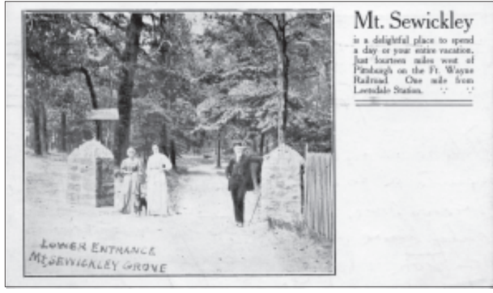
This postcard from the Sewickley Valley Historical Society collection is postmarked August 12, 1912.

I remember, I remember, The chapel on the Grounds, Each Sunday morn a bell would ring To call us with its sounds. Beautiful hymns we used to sing, That brightened up the day; They always will be close to me And help me on my way.